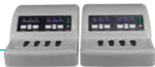
WHOLE BLOOD / OPTICAL LUMI-AGGREGOMETERS