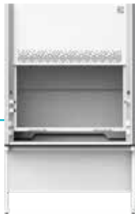
MOBILE FILTRATION SYSTEMS