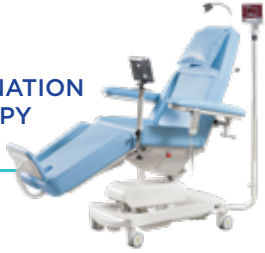
BLOOD DONATION AND THERAPY CHAIRS